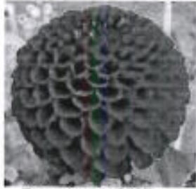
FEDERATION 2017 CHALLENGE BLOOM: CHIMACUM TROY